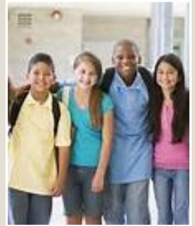
Adolescents, Teens and Tweens