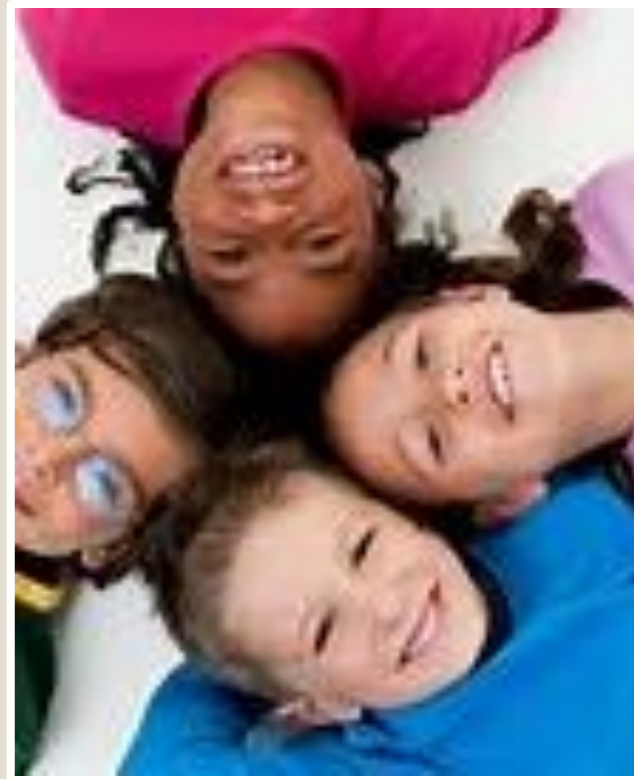
Elementary School Age