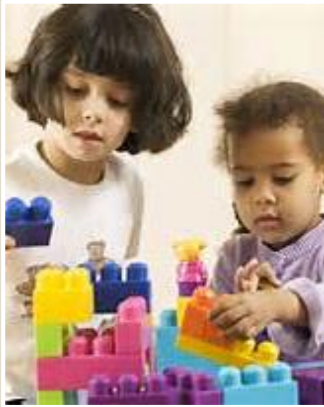
Toddlers & Preschoolers