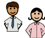
Your employer or job coach