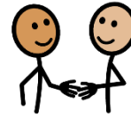
Neighbors or friends