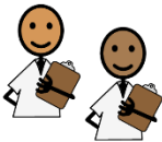
Your therapist, like speech therapist